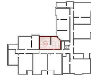
KEY PLAN SECOND FLOOR